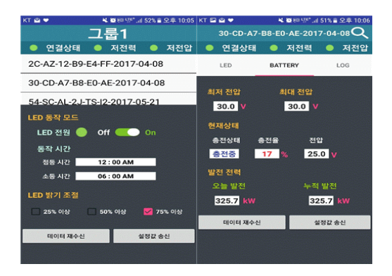
Fig.2 Monitoring and Controlling System Appearance.

(8) Provide real-time notification of street lights