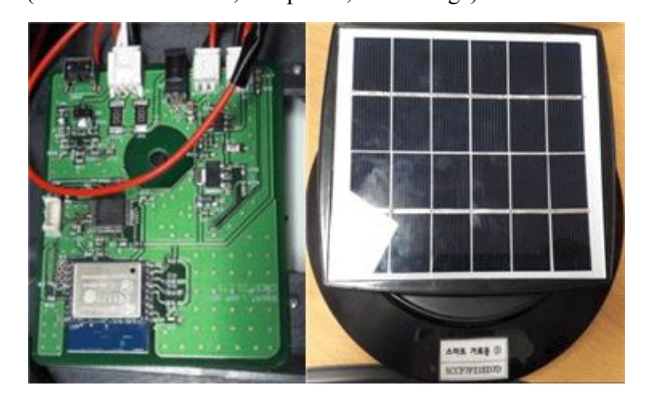
Fig.3 Hybrid Smart Streetlight Appearance.

(communication fault, low power, low voltage) information.