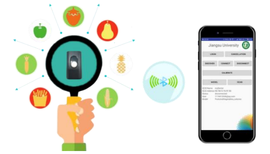
Fig.1 Schematic diagram of the detection system.

In order to overcome the shortcomings of the traditional methods, a new smart-phone application (APP) based on Android platform and portable near infrared spectrometer (NIRS) was designed for detecting contents of some substances in foods. The system has the characteristics of low power consumption, high performance, cost. low miniaturization and specialization. To our knowledge, there are few studies in the near infrared spectroscopy system based on smart-phone platform at home and abroad. The existing system also has the defect of single detection target, which cannot give full play to the advantages of near infrared spectroscopy technology. After a lot of experiments and algorithm optimization, the system was successfully designed to make up for the shortage of the existing systems.